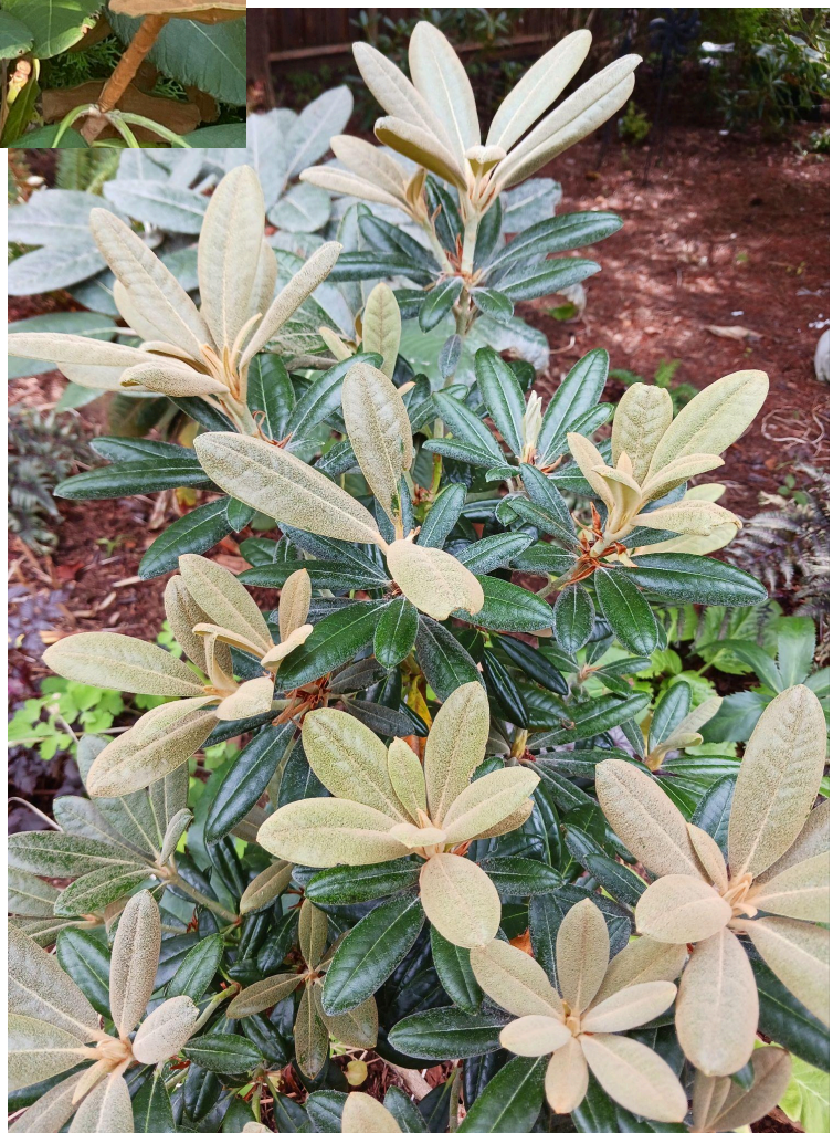
R. 'Silver Skies' (right)