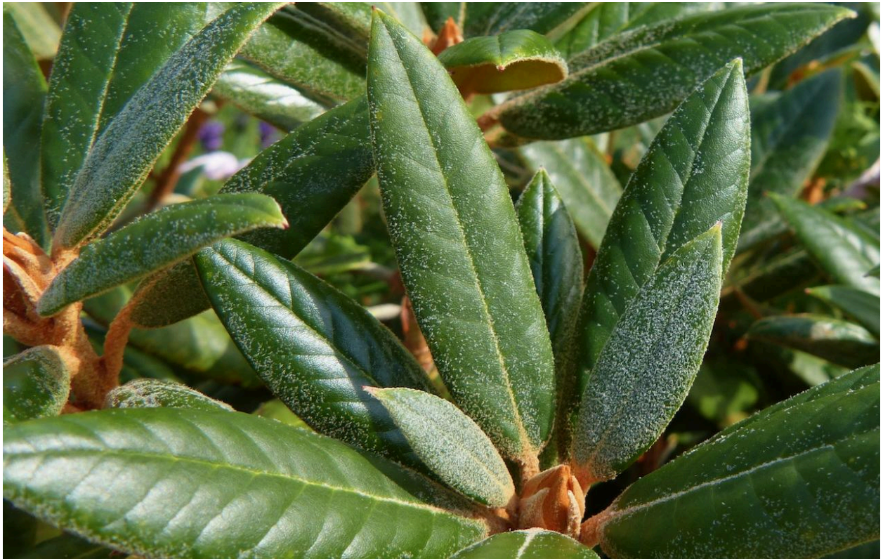
R. 'Hansel' (above), R. 'Golfer' new growth (below)