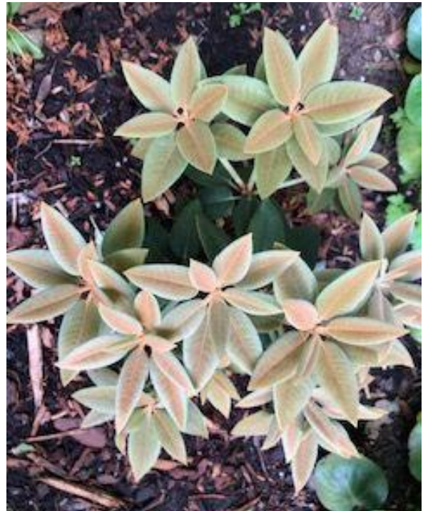
R. pachysanthum 'Buckskin'