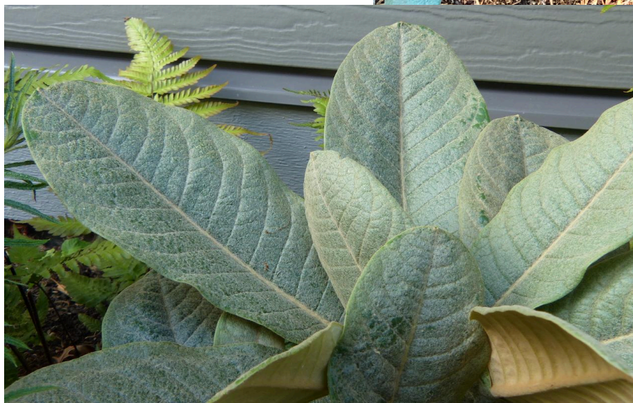
R. kesangiae