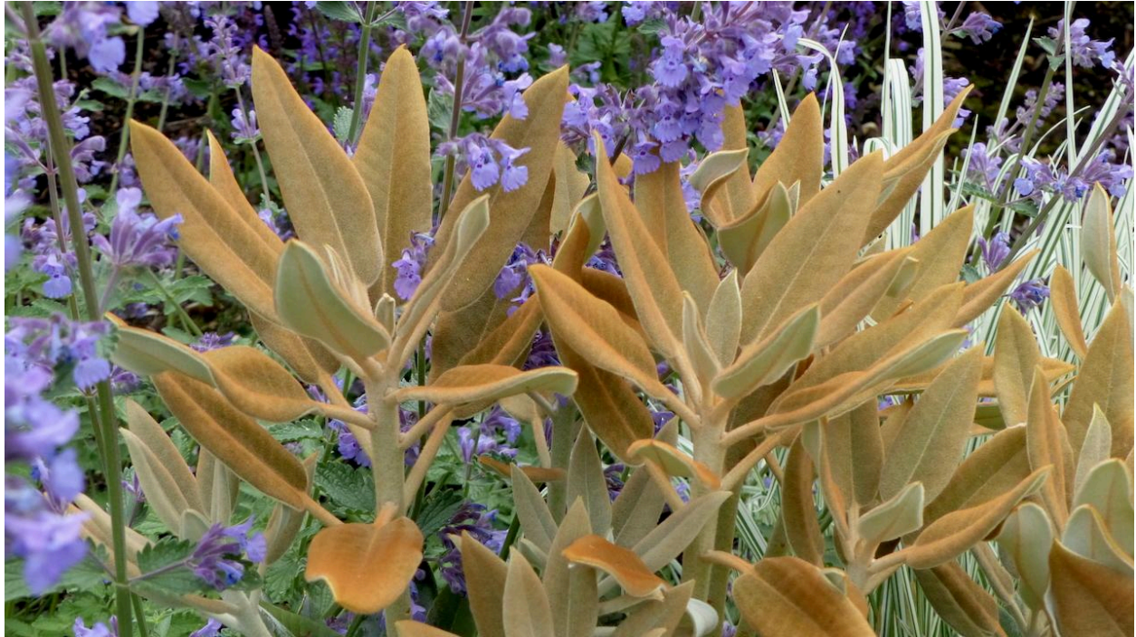
R. pachysanthum new foliage