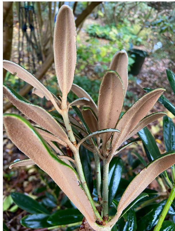
R. yakushmanum has both tomentum (left) and indumentum (right).