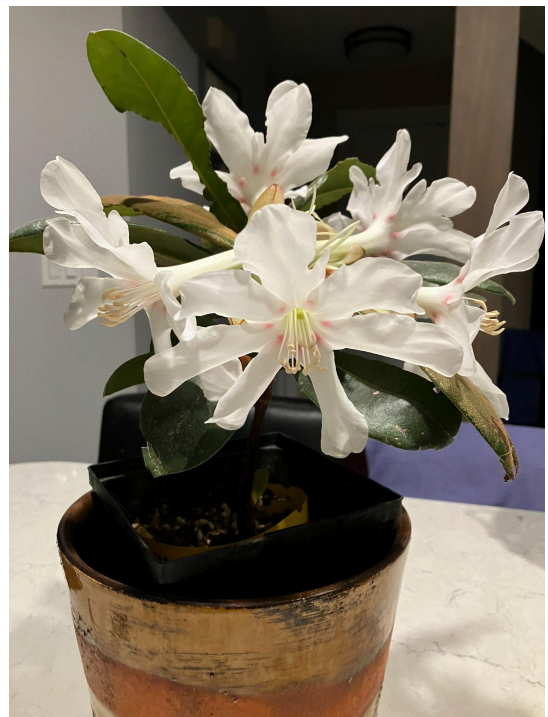
Vireya 'Saint Cecilia'

"This is a plant I purchased from the club, and it flowered last month."