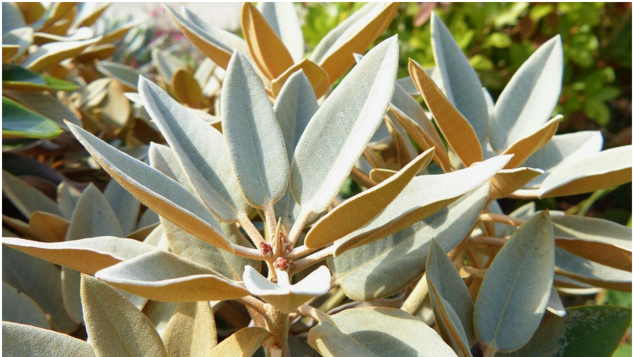
R. pachysanthum

For further information view our Convention website ARS2025.org